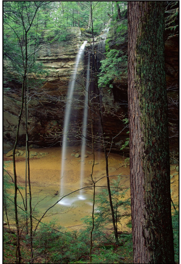
Ash Cave Falls and Dwarf Crested Iris

Early bird discount for the first 10 registered participants with deposit paid by February 1: $345 CVPS member/ $460 non-member $225 deposit; balance due February 15